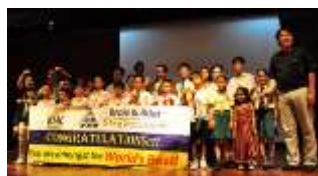
The winners from Brainbuilder - Dr. Fong Maths, in celebratory mood, with their awards