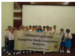
Jubilant teachers and students after receiving their awards, in Sungai Petani, Kedah