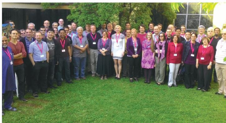
Participants from 34 countries attended the International Bebras Conference 2015 in St. Polten, Austria.

Malaysia's involvement in Bebras first competition was in 2014. Malaysia is one of the few Asian countries that are involved in Bebras, along with Japan, Kazakhstan and Taiwan. The Malaysian Beaver organizer